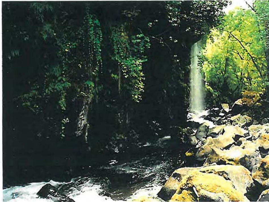
Springs near Eagle Canyon Diversion Dam