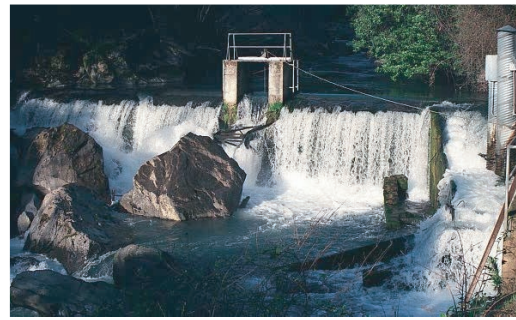
EAGLE CANYON DIVERSION DAM