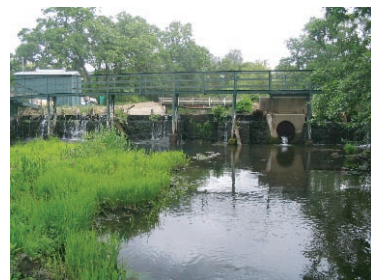
ASBURY PUMP STATION AND DAM