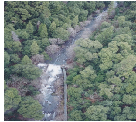
NORTH BATTLE CREEK FEEDER DIVERSION DAM