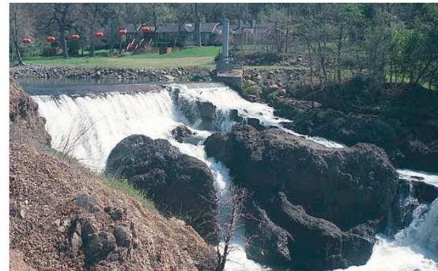
INSKIP DIVERSION DAM